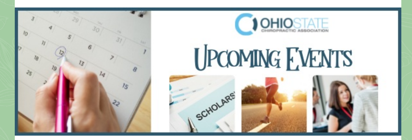
June/July - 2nd Annual "Chiropractic Keeps Me Moving" 5K