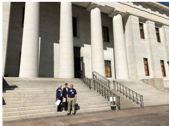
Doctors stand in front of the Ohio Statehouse on Advocacy Day.