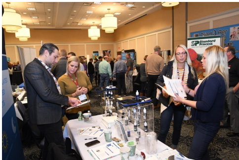
Our vendor hall had over 50 vendors with the latest products and technology.