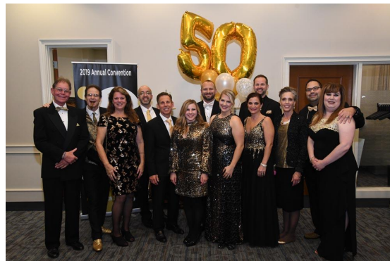
District 4 members pose for a photo.